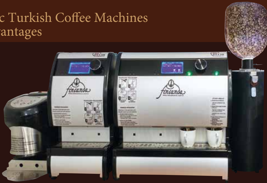
Automatic Single Puffing Turkish Coffee Grinding Machine